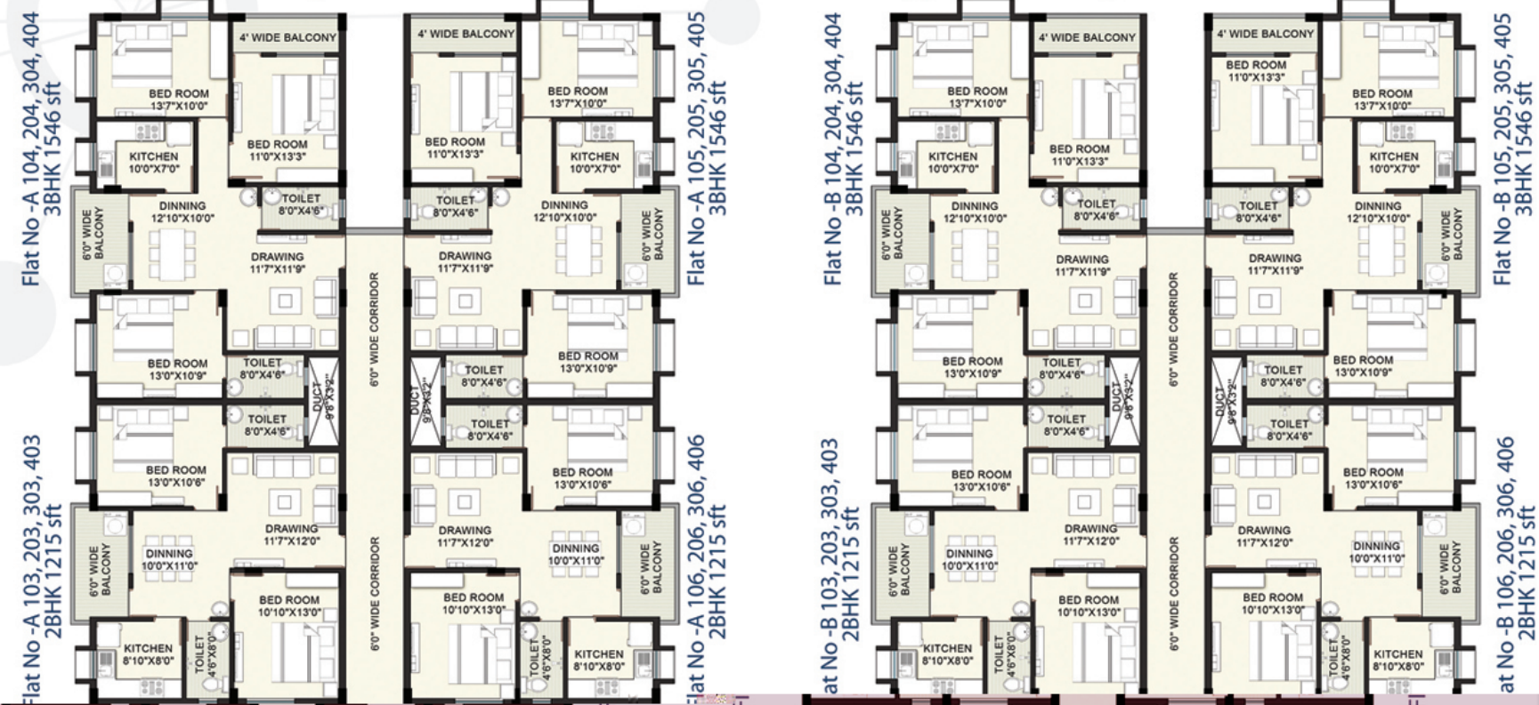
Typical floor plan of Block-B